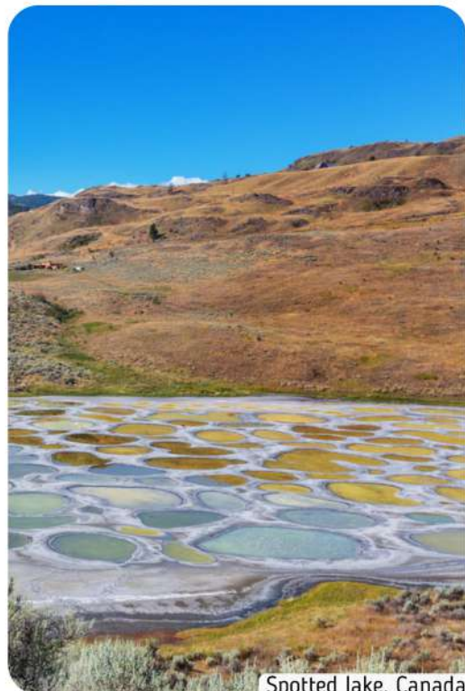
Spotted lake, Canada